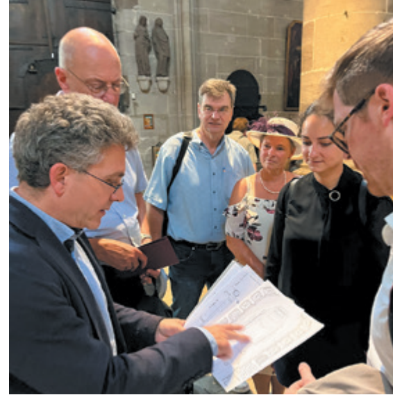
Discussing site details for next year’s tour in Germany.

The ties that connect us through music are