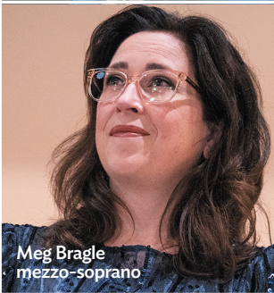
Meg Bragle mezzo-soprano