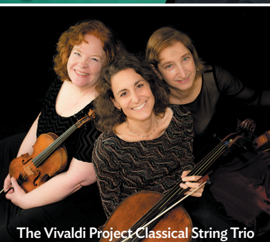
The Vivaldi Project Classical String Trio