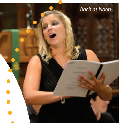
Bach at Noon