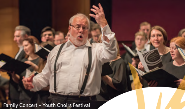
Family Concert – Youth Choirs Festival