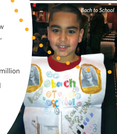
Bach to School