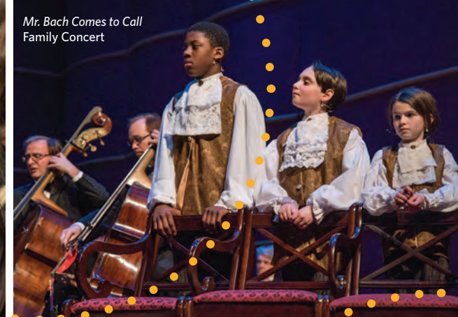
Mr. Bach Comes to Call Family Concert

The Choir and the Festival have endured through thick and thin, because they bring to the music not just a consistently high standard of musicianship, but a precious intangible – the fact that the music is a living expression of community.