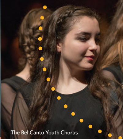
The Bel Canto Youth Chorus