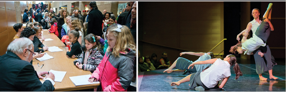
Dancers from the De Sales University (above) and the Lehigh Valley Charter High School for the Arts