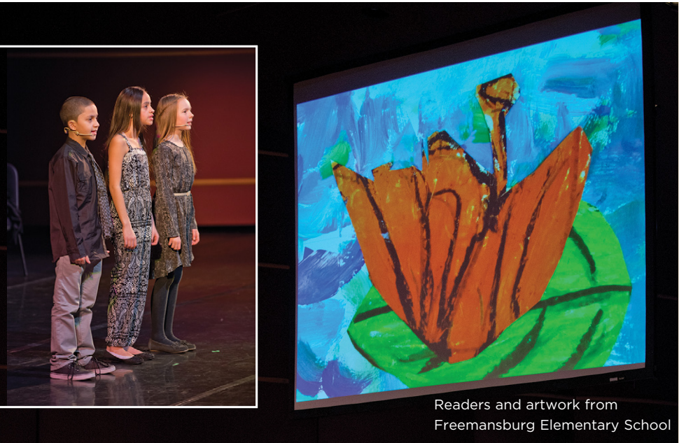
Readers and artwork from Freemansburg Elementary School