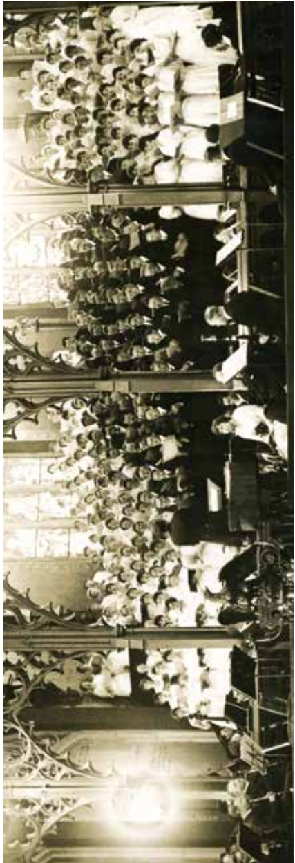
Packer Church – Festival Seating Chart